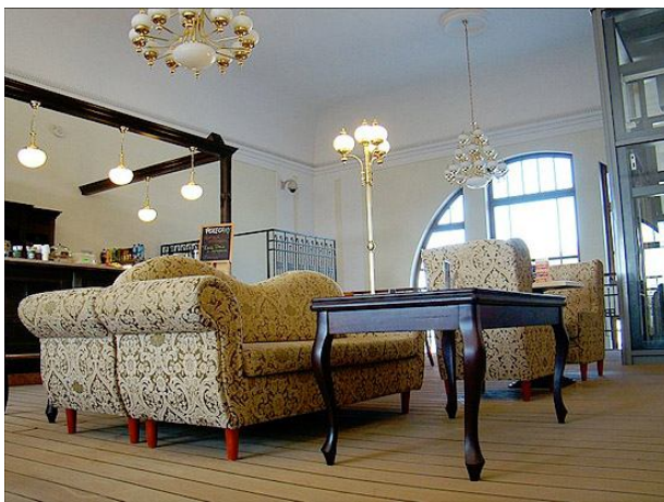
The restaurant at the train station

There are two medieval wooden churches in our town.