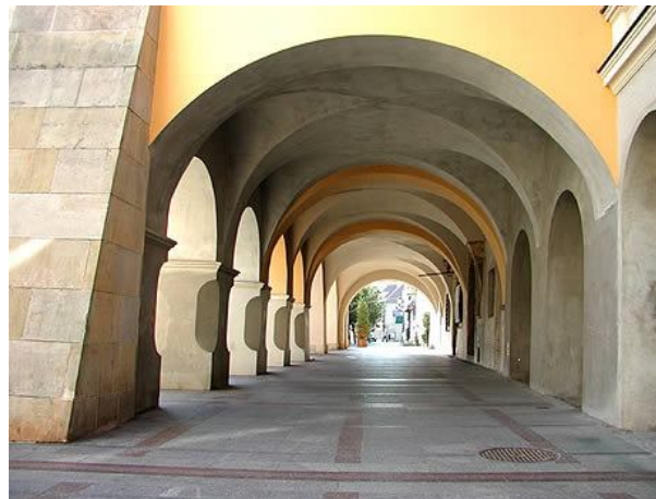
Tenement house arcades

It is said that Tarnów has similar ambiance and character to the Italian towns. That is because of the Italian architects such as ; Bartholomeo Berecci, Jan Maria Padovano and Santi Gucci, who had created it .