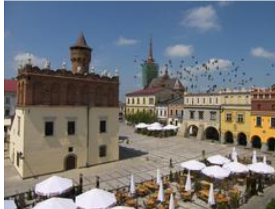
The Town Hall

It's "the pearl of the Polish renaissance". We have got many antiques from that time. The most well-known one is the Town Hall rebuilt in that style. You must see the tenement houses around the Market Square and tombstones in the Cathedral (the highest ones in the entire Europe!), and also the "Florentine" house.