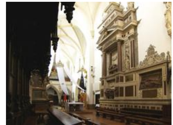
15 meter high tombstone of Tarnowski family in our Cathedral