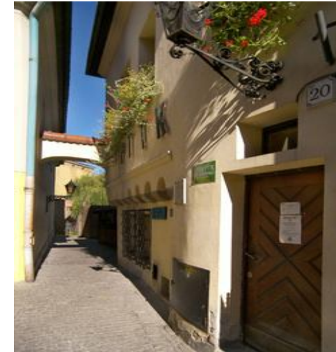
The 'Florence House'

It is said that Tarnów has similar ambiance and character to the Italian towns. That is because of the Italian architects such as ; Bartholomeo Berecci, Jan Maria Padovano and Santi Gucci, who had created it .