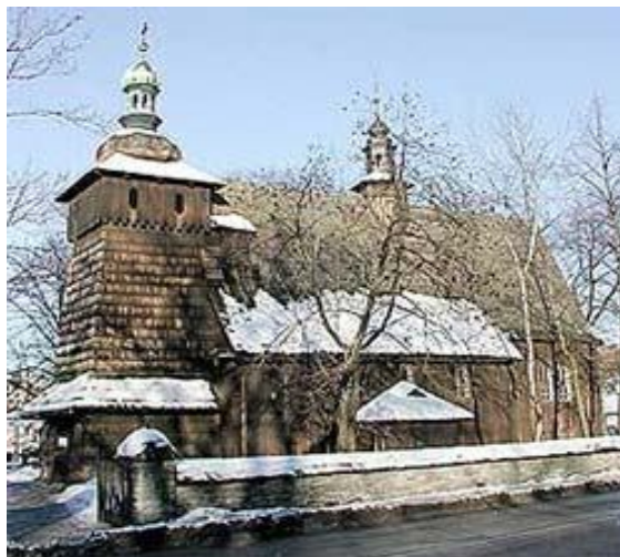
One of the preserved wooden churches. St. Maria's church

There is also the trail going through our town called "Trail of wooden architecture"