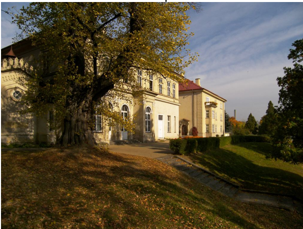
It is the warmest in here - the palace of the Sangusko Dukes

It is warmest, the most sunny one. and it has the best weather in the entire Poland. That fact was confirmed by institute of Meteorology and Water Economy in the year 2007 . From now on Tarnów is called " the Polish pole of warmth"