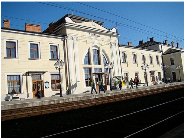
The view of the train station

□ We have the most beautiful train station in Poland. It comes from the times of the Austrian Empire. It was restored recently and it truly deserves it's fame