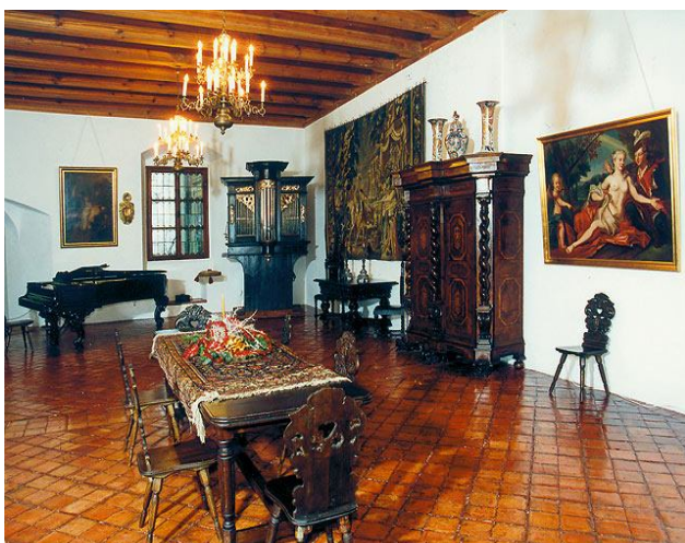
One of the rooms in the castle

□ If you are interested in the ruins of the castle, our region will not disappoint you.