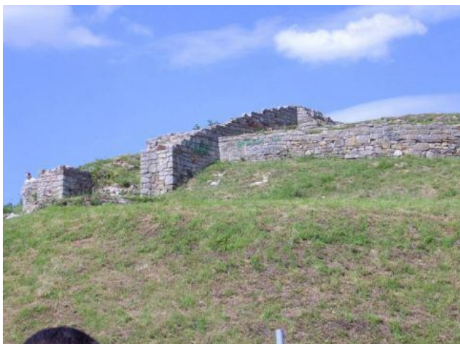
The ruins of the castle „Tarnowskich” on Mount St. Martin

□ If you are interested in the ruins of the castle, our region will not disappoint you.