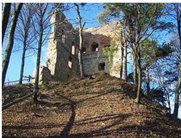
Ruins of the castle in Melsztyn.

Pretty close you can visit the oldest continuously active industrial plant in Europe - a salt mine in Bochnia.