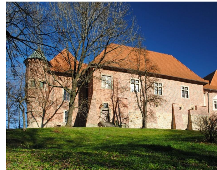
Gothic castle in the village Dębno.

Only here you can meet the ghost of „Tartówna” at the Dębno Castle